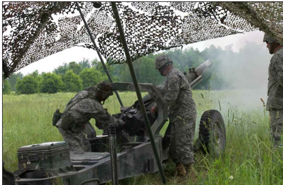
The first shot down range. Artillery Soldiers from 1 st Battalion, 258 th Field Artillery performed live-fire gunnery training on 17 June. It has been nearly five years since the 258 th fired howitzers as a unit. The unit deployed in support of Operation Iraqi Freedom in 2002 but were cross-trained as Military Police. During their annual training at Fort Drum, the 258 th conducted a training phase known as "Reset" until they were ready to receive new M102 howitzers.