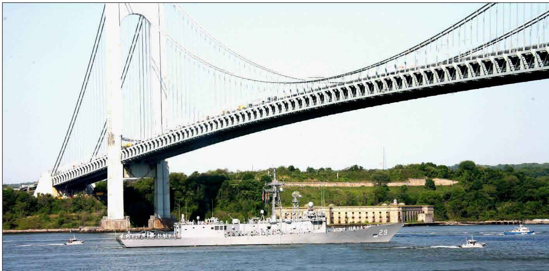
Members of the New York Naval Militia Military Emergency Boat Service (MEBS) provide escort and security support to the initial arrival of vessels past the Verrazano Narrows Bridge for Fleet Week in New York City on May 23, 2007. The MEBS patrol boats partnered with members of the U.S. Coast Guard to provide additional security measures during the week-long event.