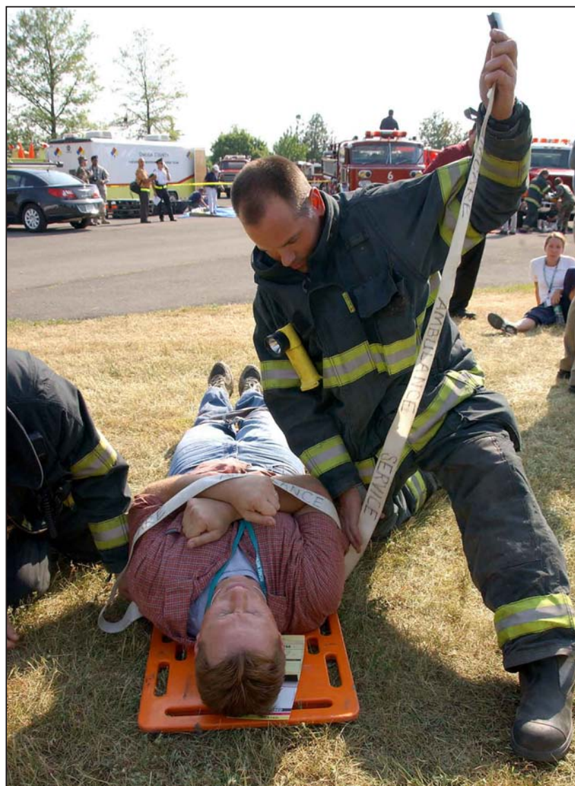
A Rome Fire Department firefighter works to stabilize a Northeast Air Defense Sector simulated victim during the Griffiss Park Mass Casualty Exercise June 7. The exercise challenged first responders to perform their triage and hazmat procedures on victims of a simulated terrorist attack.

NEADS is a joint, bi-national organization charged with performing a critical homeland defense mission by providing air sovereignty and counter-air operations over the eastern United States. The unit directs the employment joint air defense assets to defend one million square miles, 16 major cities and adjacent seas. □