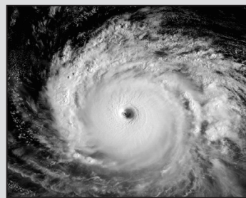
Hurricane satellite photo image courtesy of Hurricanetrackinfo.com

“While most members of the unit have conducted