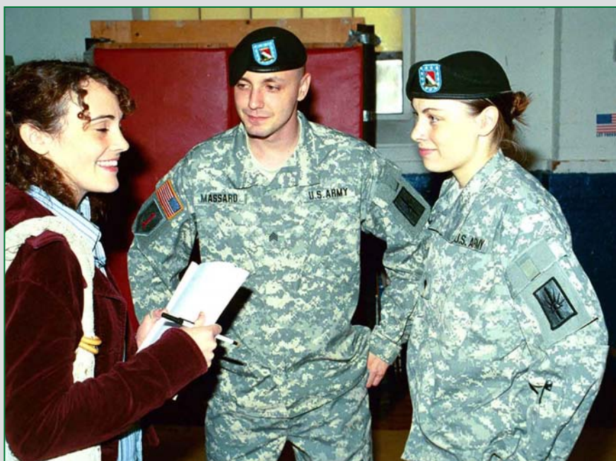
Soldiers of the 104 th Military Police Battalion, Headquarters and Headquarters Detachment, take time to conduct a television interview with a Hudson Valley based news team during their May 18th deployment send-off ceremony in Kingston. The unit will train at Fort Bliss, Texas prior to deployment to Iraq and is expected to return to New York in June of 2008.