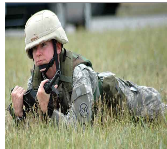
A 27 th Soldier hones his warrior skills by doing a low crawl during the Brigades AT which focused on individual skill validation and weapons qualification.

The 27 th will conduct another aggressive three-week Annual Training period in October at Fort Drum to continue its efforts and has already begun preparations for it during monthly drills scheduled through the summer and into the fall. □