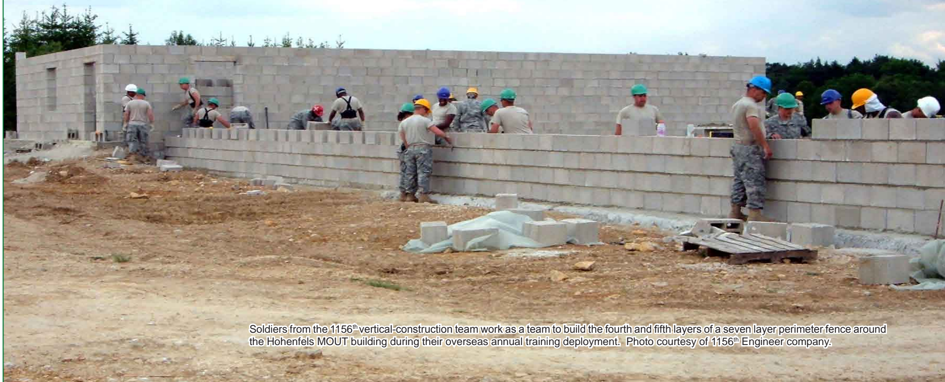
Soldiers from the 1156 th vertical-construction team work as a team to build the fourth and fifth layers of a seven layer perimeter fence around the Hohenfels MOUT building during their overseas annual training deployment.