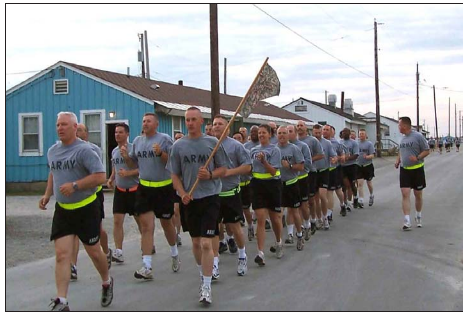
Members of the 27 th BCT's Training Assistance Group formed up early in the morning on their last day of AT for what has become a tradition to run a three-mile course around the "Old Post" of Fort Drum.

Key training events included infantry security force activities, live fire, support operations and for the first time a special external evaluation of selected 108 th Infantry Soldiers assigned to a terror response team dubbed "CERF-P" (pronounced SERF-PEE.) The team's special assignment is to respond to potential future terrorist attacks in New York where a chemical, biological or radiological weapon has been used. For the last year, Soldiers of the 108 th trained intensely for the external evaluation that was accomplished on 17 June.