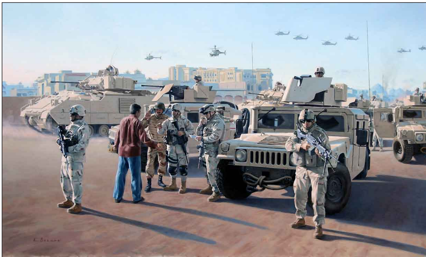
The 42 nd Infantry Division commemorative print, "Never Forget" depicts members of Task Force Liberty and the 42 nd Infantry Division preparing for operations in Tikrit, Iraq. Thousands of members of the 42 nd Division formed the foundation of the Multinational Division, North Central Iraq for the task force deployment in late 2004 to early 2006 for Operation Iraqi Freedom. The commemorative print will also depict graphical representation of the Task Force Liberty brigade combat teams, aviation brigade, division artillery, engineer brigade and division support command. The print is available framed or unframed through the 42 nd Infantry Division Headquarters in Troy or online from a framing company at www.vladimirarts.com .

Questions about the commemorative portrait can be sent to OIF3pic@hotmail.com . □