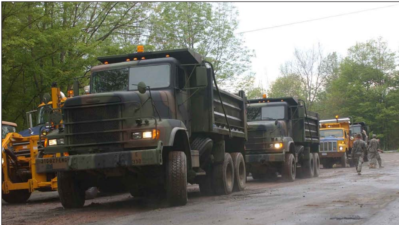
Dump trucks from the 204 th Engineer Battalion and the 827 th Engineer Company of the New York Army National Guard partner with trucks from the NYS Dept. of Transportation, NYS Dept. of Environmental Conservation and Towns of Hancock and Colchester to haul dirt to the areas washed away in mid-June by flash floods along the Holiday Brook in the two Adirondack communities.

Nineteen other National Guard Soldiers and Airmen supported the operation with logistics, communications, and command and control oversight. More than 50 National Guard personnel were involved in the response to support the local community. □