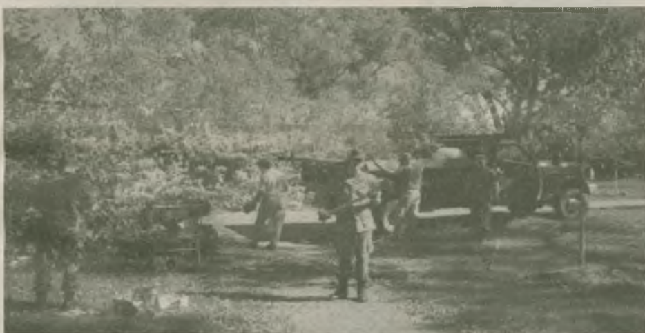
Members of the 127 Armor Battalion volunteer for the annual Great Lakes Beach Sweep along the Buffalo River Shoreline.