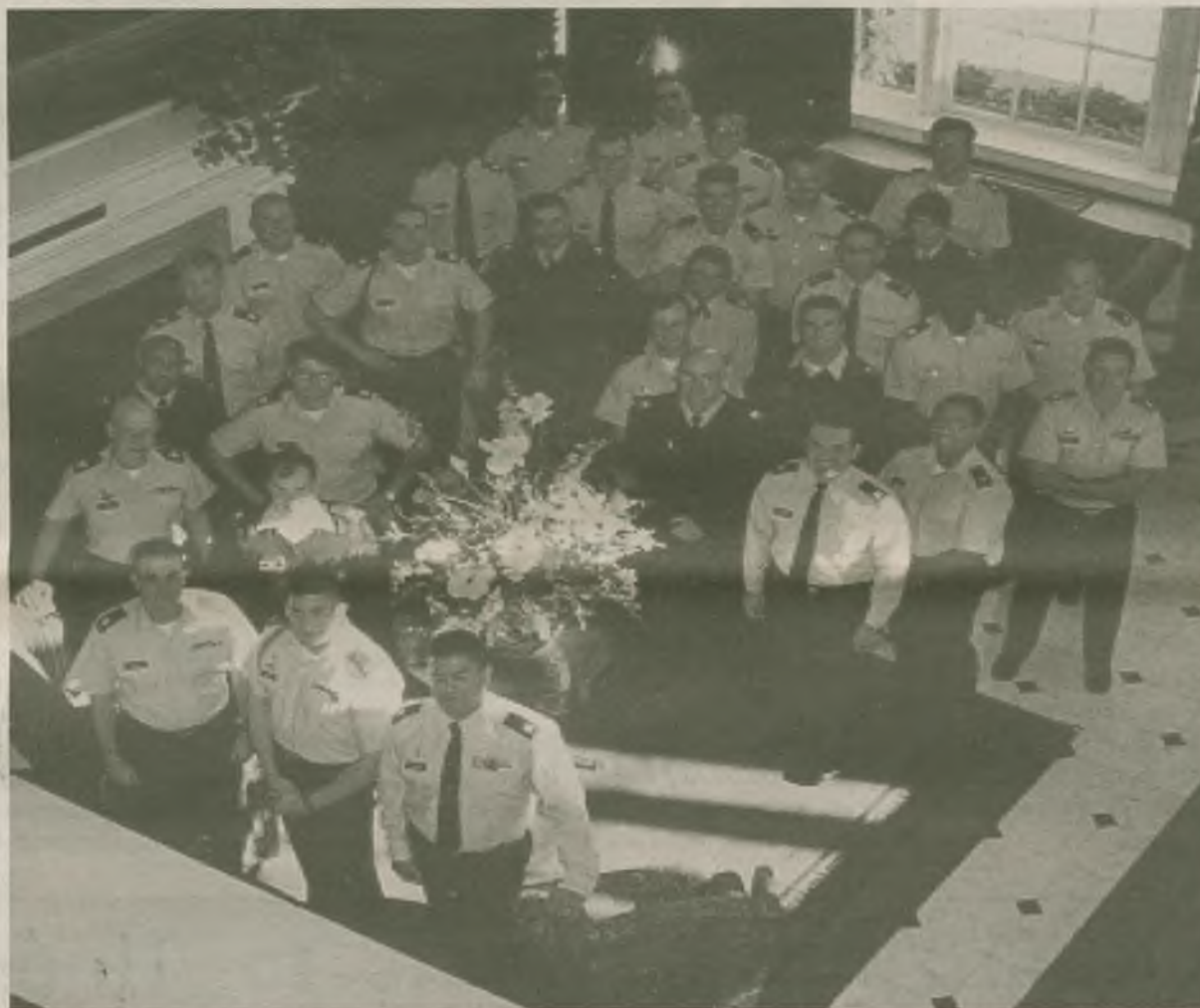
New York's future leaders pose for a graduation picture from the Company Commander's Course. The course prepares incoming leaders for the responsibilities and demands of company command in the New York Army National Guard.

"This course was designed to give unit commanders access to our top leadership, and this contact serves all because of the sharing, listening and learning which happens"