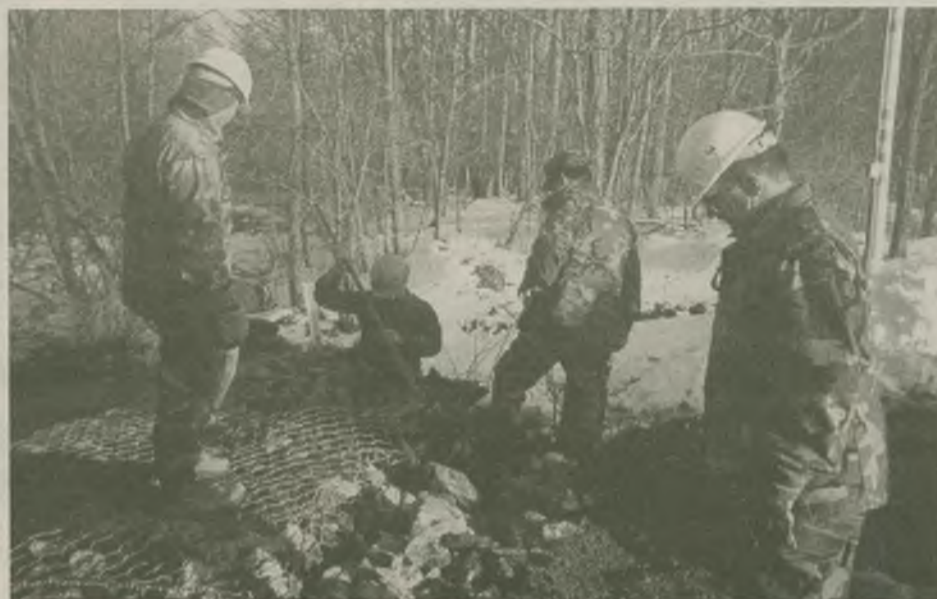
Members of Binghamton's 10th Brigade of the New York Guard work to restore stone-filled berms at the state's Guilderland Range Facility following the devastating rains of Hurricane Floyd. Inset: The State Police target shack was nearly destroyed by floodwaters.