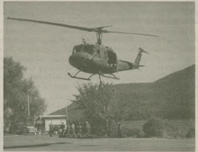
Crews from the Rochester aviation flight facility and the 1st Battalion 142nd Aviation conduct firefighting training on Canandagua Lake in Central New York. The aircrew training is an annual mission requirement that also provides a GuardHELP link to the region's Park Service.

CANANDAIGUA LAKE – With forest fires raging in various parts of New York this summer, pilots and crews from the National Guard's Army Aviation Support Facility #2 underwent training for any potential threat to central New York.