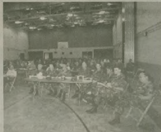
The New York Guard-sponsored legal training seminar was held in Baker Hall at Camp Smith.