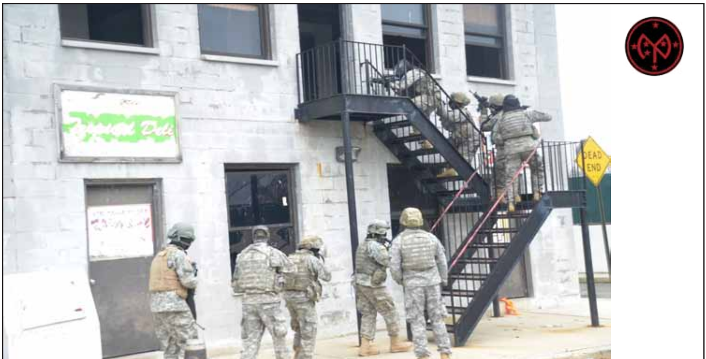
Soldiers of Company A, 1st Battalion, 69th Infantry use a fire escape to enter a building during tactical training at the New York Police Department training facility and range in New York City on Jan 9.