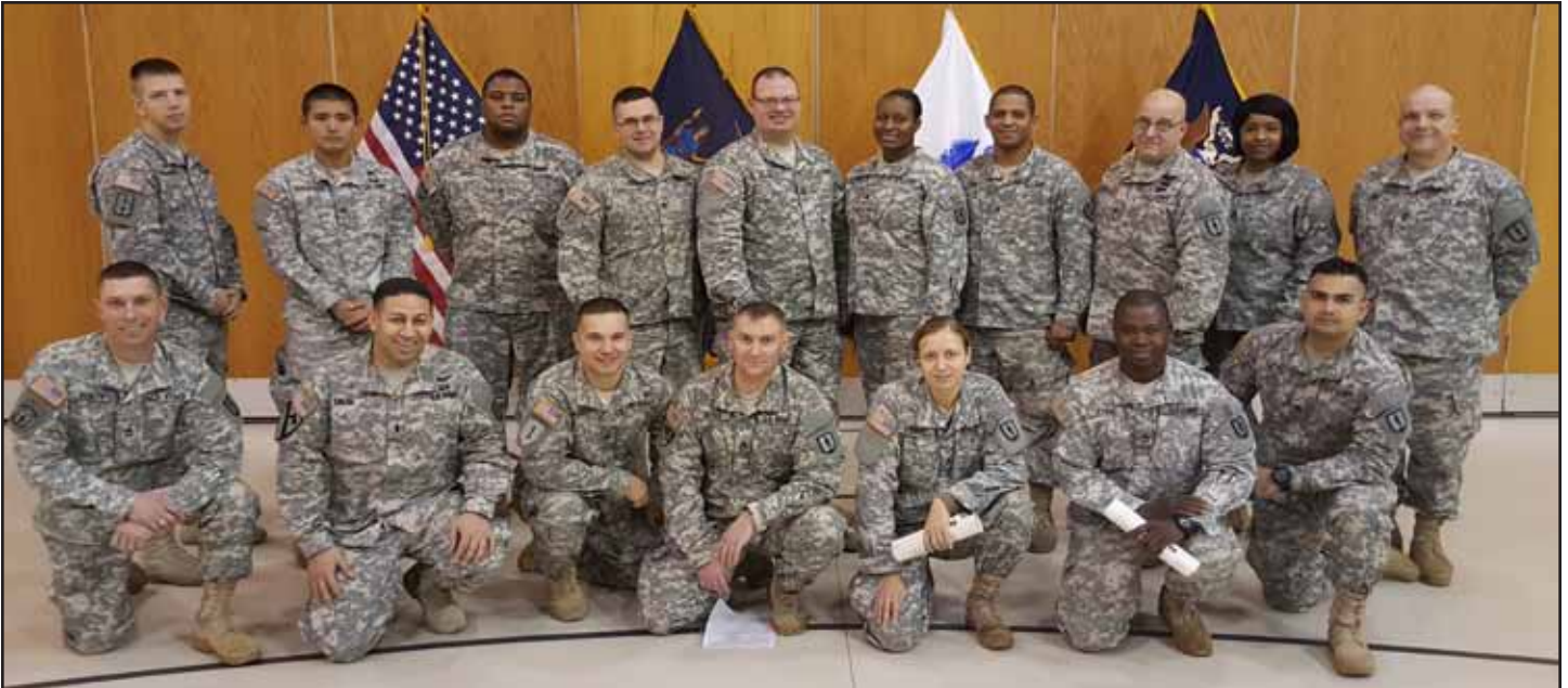
CAMP SMITH TRAINING SITE — Soldiers who successfully completed the 106th Regional Training Institute's Army Basic Instructor Course here pose for a class picture on Nov. 18. The class prepares officers and non-commissioned officers to provide effective classroom instruction. Participants included Soldiers from the New York Army National Guard's 106th Regional Training Institute, the 27th Infantry Brigade Combat Team, the 53rd Troop Command and a member of the District of Columbia Army National Guard.