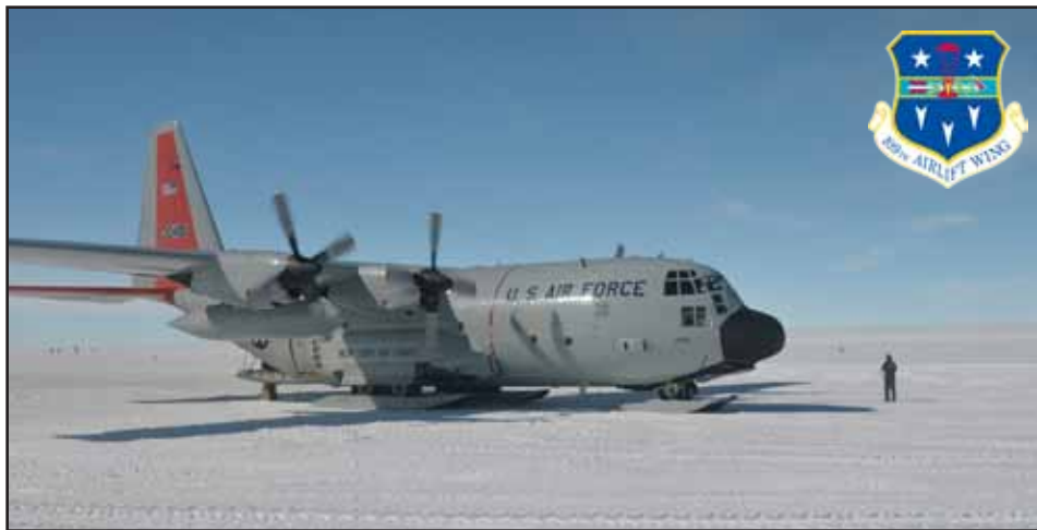
A New York Air National Guard 109th Airlift Wing LC-130 Skibird at Summit Station, Greenland, on June 30, 2015. Airmen and aircraft staged out of Kangerlussuaq, Greenland, during the summer months, supplying fuel and supplies and transporting passengers on the Ice Shelf in Greenland.