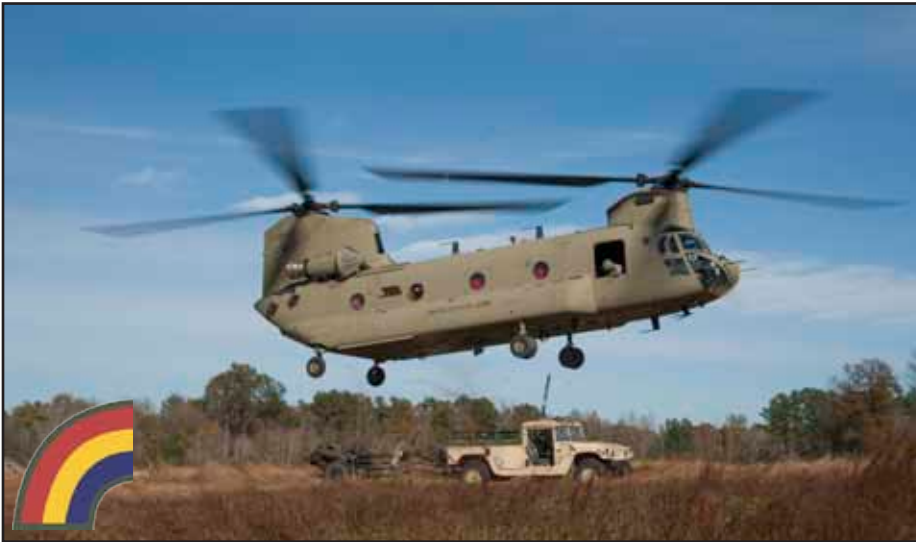
A CH-47 Chinook helicopter from the New York National Guard's 42nd Combat Aviation Brigade inserts a Humvee and howitzer from Battery A, 3rd Battalion, 320th Field Artillery Regiment, 101st Division Artillery, 101st Airborne Division (Air Assault), into Landing Zone Aardvark during an Air Assault on Fort Campbell, Ky., Oct. 30. The Soldiers of the 320th FAR, along with the rest of the DIVARTY, conducted air-assault missions with the 42nd CAB in order to develop their ability to support the division's maneuver forces by performing both gun raid missions and follow follow-on support missions, providing constant indirect fire support.