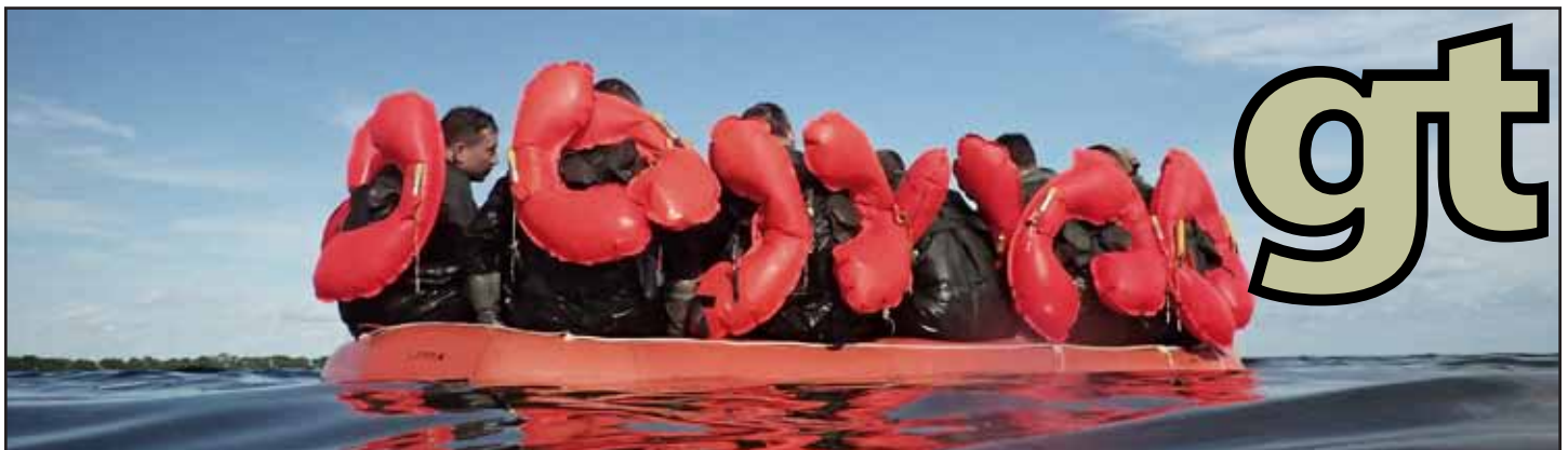
Members of the 101st Rescue Squadron conduct water-survival training near Homestead Air Reserve Base on Jan. 20. The squadron is part of the 106th Rescue Wing. More pictures can be found on page 26.

Finally, I want to circle back to where I started. It has been an honor to lead this great organization. Every great organization is made up of great people; and that is what I'll remember and miss the most. It has been an incredible privilege to serve with so many magnificent people — uniformed and civilians, privates and colonels. Thank you for what you all do every day. gt