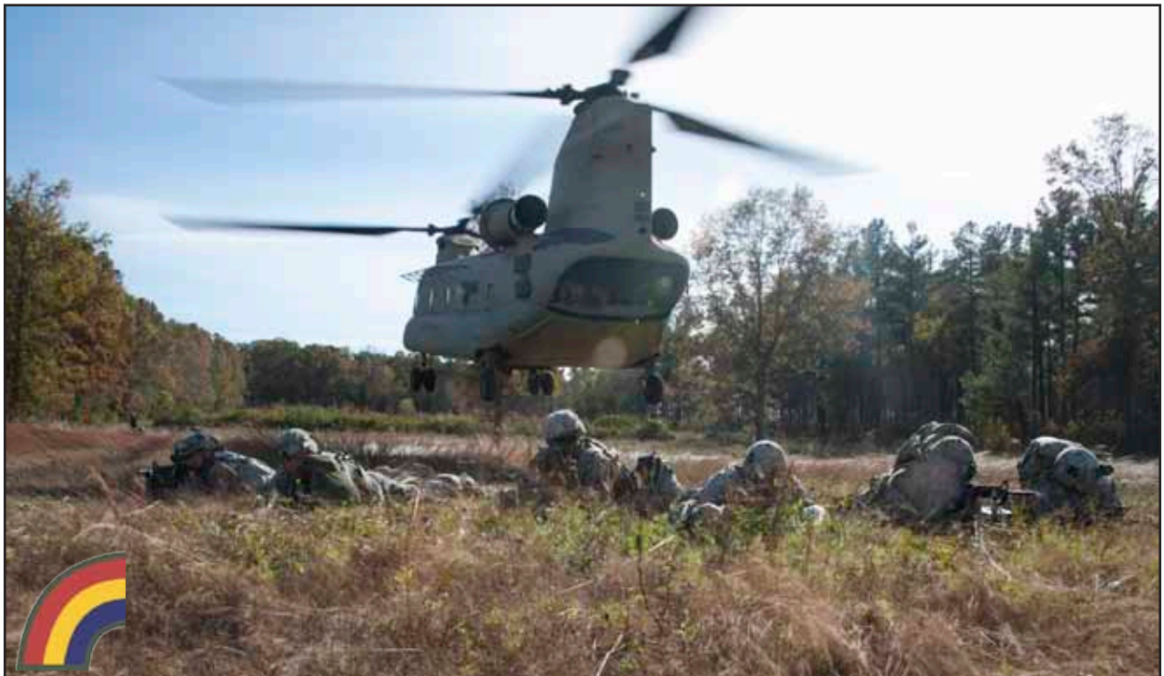
Soldiers of the 101st Division Artillery, 101st Airborne Division (Air Assault), establish security after being inserted into a landing zone by 42nd Combat Aviation Brigade aircrews.