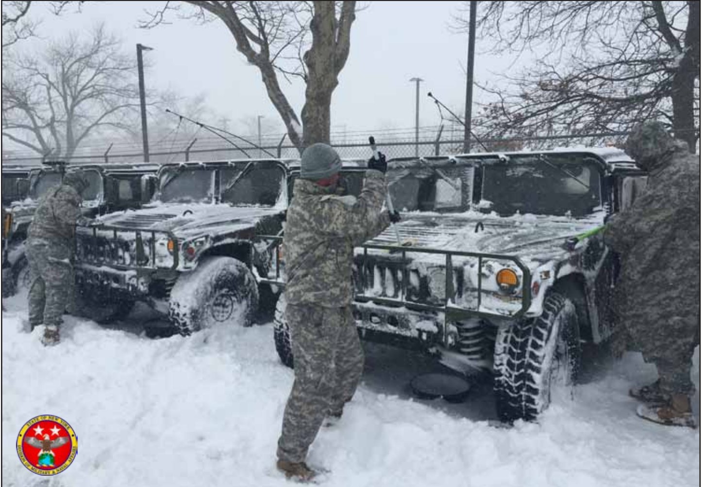
Soldiers of Joint Task Force Empire Shield clear snow from Humvees at Fort Hamilton, Brooklyn, on Jan. 23 as a major blizzard hits New York City.

The New York National Guard mustered 51 vehicles and had 329 Soldiers and Airmen on duty and ready to respond as a massive blizzard hit Long Island and New York City on Jan. 23.