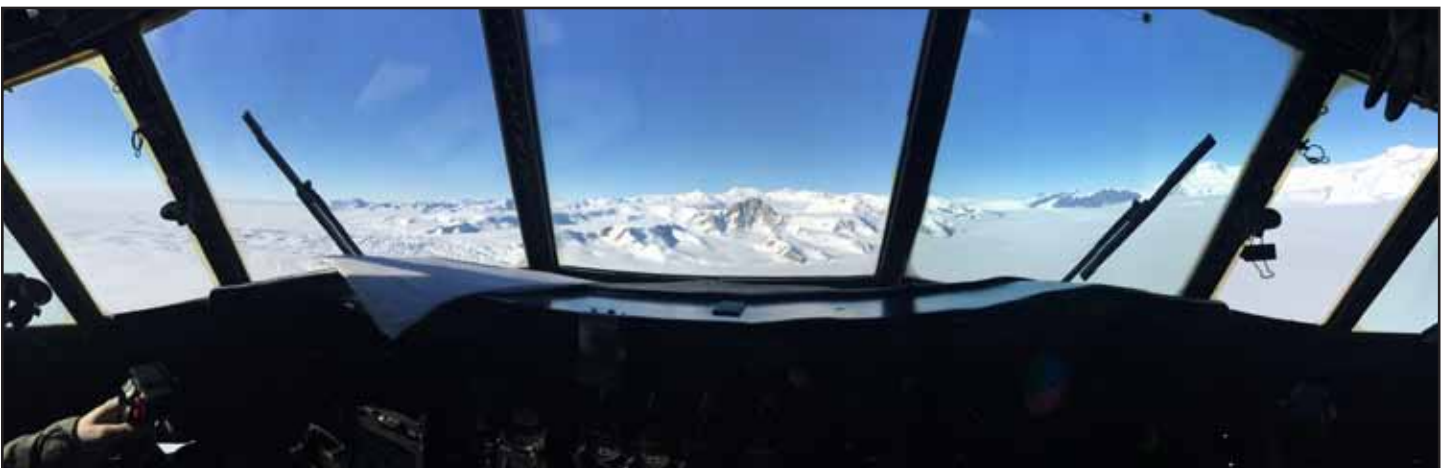
ANTARCTICA — An aircrew of the 139th Exeditionary Airlift Squadron fly an LC-130 "Skibird" in support of Operation Deep Freeze here on Dec. 2. A total of seven LC-130s were deployed from the New York Air National Guard's 109th Airlift Wing in Scotia, New York last season, which ended in February. This is the 28th season that the unit has participated in Operation Deep Freeze, the military component of the U.S. Antarctic Program, which is managed by the National Science Foundation.