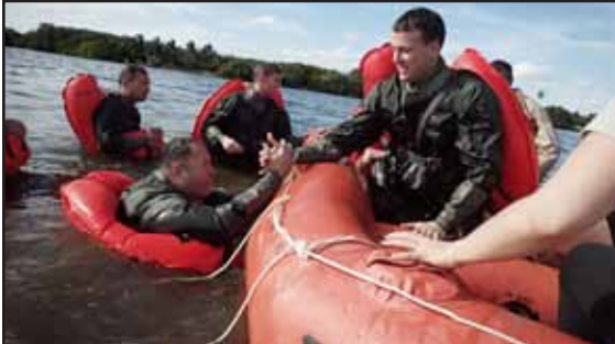
Members of the 101st Rescue Squadron conduct water-survival training near Homestead Air Reserve Base on Jan. 20. Members trained on the use of seven and twenty-man survival rafts, the ability to work as a team in open water, and the use of their survival equipment. The squadron is part of the 106th Rescue Wing. More pictures can be found on page 26.