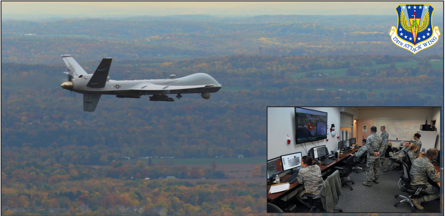
A remotely piloted MQ-9 Reaper operated by the New York Air National Guard's 174th Attack Wing flies a routine training mission over Central New York on October 23, 2016. Inset photo: California Air National Guardsmen of the 195th Intelligence, Surveillance, and Reconnaissance Group analyze full-motion video of the Thomas Fire at Beale Air Force Base, Calif., and relay their findings to fire crews on the ground, Dec. 11, 2017. The team is using imagery from the MQ-9 Reaper to map the fire lines and look at fire expansion and progression.

SYRACUSE, N.Y.-- Nine members of the 174th Attack Wing were dispatched to California December 13, 2017 to assist the California Air National Guard's 163rd Attack Wing in flying MQ-9 remotely piloted aircraft which have been assisting local authorities in fighting the massive Thomas Fire.