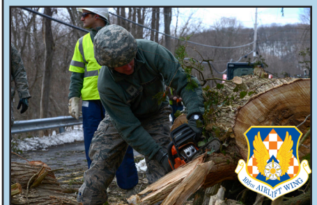
An Airman from the 105th Airlift Wing clears debris from a road in the town of Carmel, N.Y. on March 5.

"We are backfilling the need for extra manpower because of the amount of trees that came down and are blocking roadways and stopping power lines from being repaired," Galioto said.