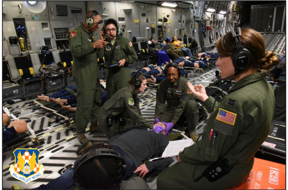
Airmen from multiple aeromedical evacuation squadrons treat a patient during a mock emergency scenario en route to Jackson, Mississippi, Feb 15, 2018. Airmen from multiple squadrons formed teams to coordinate and work together for the PATRIOT South 2018 exercise.

FCCs are divided into regions composed of multiple states. The centers have Patient Receptions Areas staffed with nurses, doctors, litter bearers, transportation teams, joint patient tracking teams, and additional medical team members for oversight.