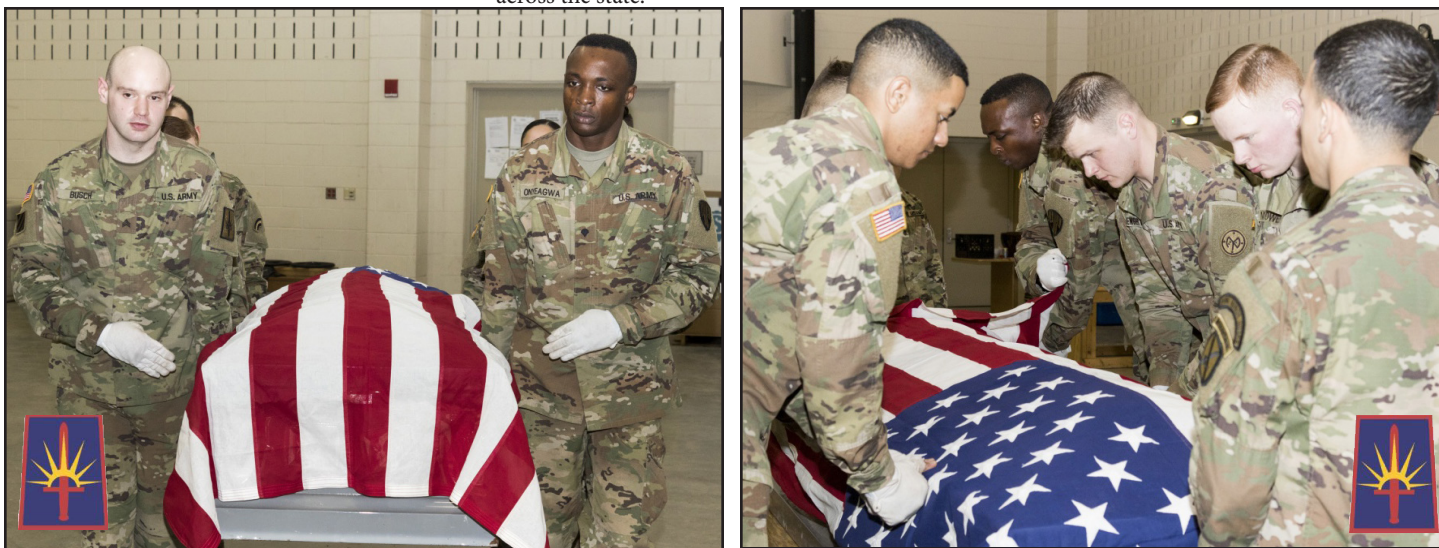
New York Army National Guard Soldiers practice carrying drills during in the 40-hour Level One Honor Guard Training Course at Camp Smith Training Site, Cortlandt Manor, N.Y., Mar. 1, 2018. This physically demanding course is designed to train and test Soldiers' abilities at the nine unique positions of the modified military funeral honors detail.