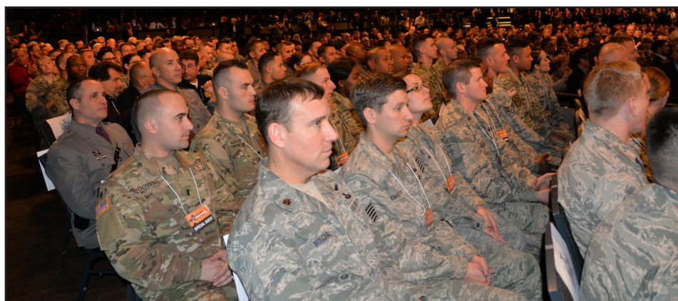
ALBANY, N.Y. -- National Guard troops attend Governor Andrew M. Cuomo's annual State-of-the-State Address in the Empire State Convention Center here on January 3rd, 2018. The governor traditionally lays out his agenda in the speech before state legislators and other officials which is televised across the state. 50 members of the New York National Guard were in the audience and recognized for their service.