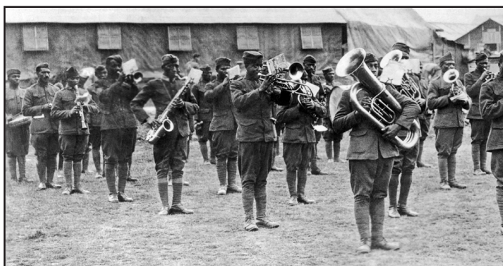
At top, Soldiers of the 369th Infantry Regiment man a trench in France during World War I. Above, members of the 369th Regimental Band perform in France. Courtesy photos.

new regimental number as the now-renamed 369th Infantry Regiment. Not that it mattered much to the Soldiers; they still carried their nickname from New York, the Black Rattlers, and carried their regimental flag of the 15th New York Infantry everywhere they went in France.