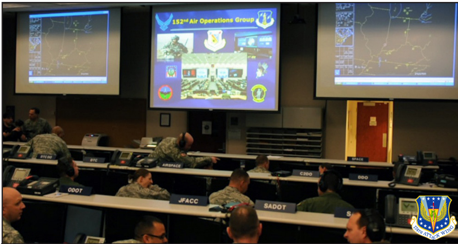
Airmen of the 152nd Air Operations Group man work stations during Virtual Flag, a computer wargame held Feb. 18-26 from Hancock Field Air National Guard Base in Syracuse. The computer hookup allowed the air planners of the 152nd to interact with other Air Force units around the country and in Europe.