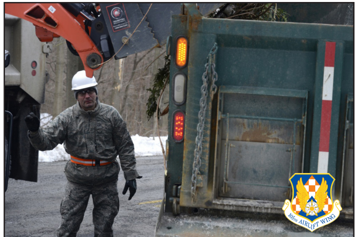
Twenty Airmen assigned to the 105th Airlift Wing deployed to Putnam County, New York, in early March to help town and county workers clear debris from roadways. The county was hit hard with a winter storm knocking down trees and causing widespread power outages.