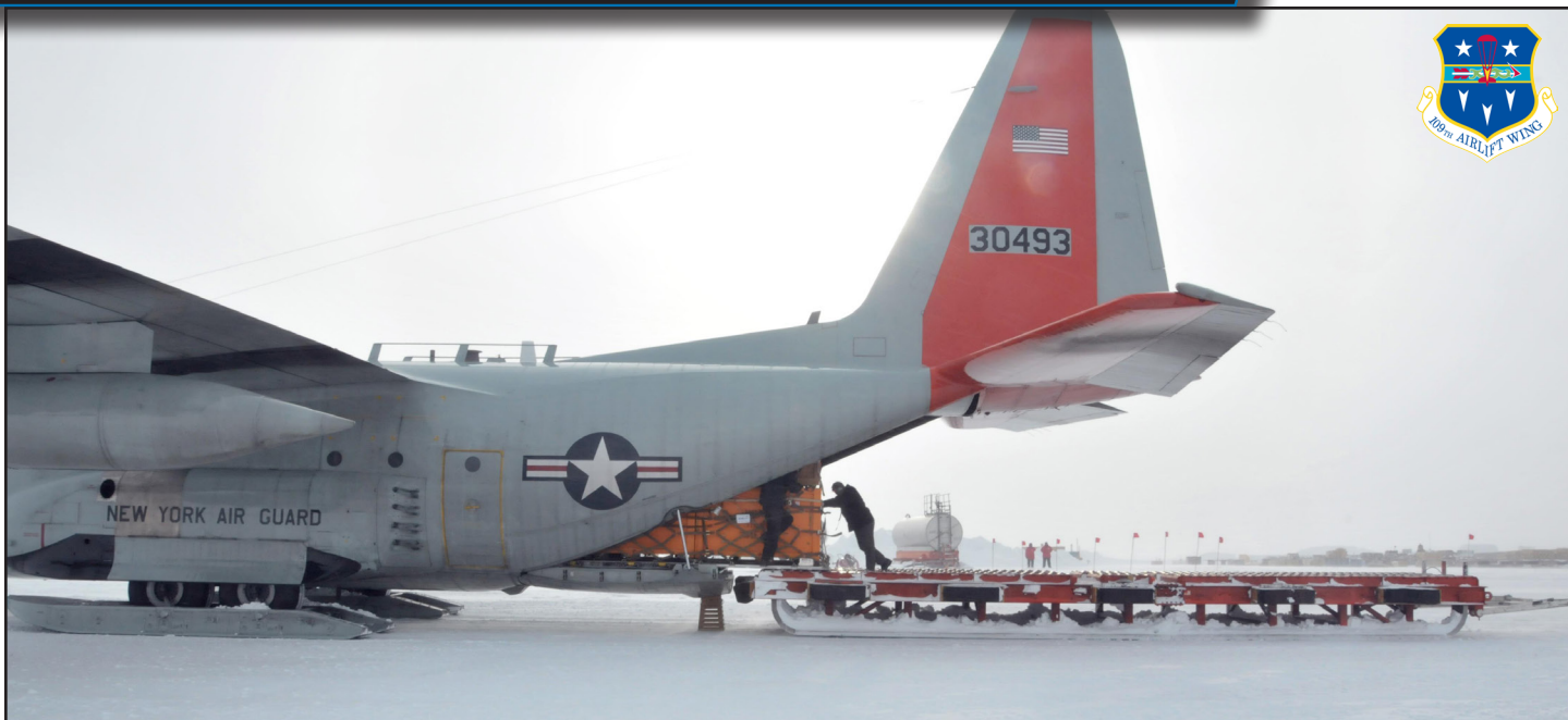
Airmen with the 139th Expeditionary Airlift Squadron load cargo onto an LC-130 "Skibird" at Amundsen-Scott South Pole Station, Antarctica, Nov. 9, 2017. The Airmen are deployed to Antarctica in support of Operation Deep Freeze (ODF), the logistical support provided by the Department of Defense to the U.S. Antarctic Program.