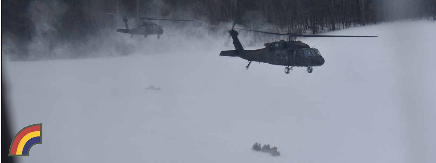
Two UH-60 Black Hawk helicopters from the 3rd Battalion, 142nd Aviation prepare to depart a landing zone after delivering Soldiers of the U.S. Army Reserve's 403rd Civil Affairs Battalion during training in Cooperstown, N.Y. March 3rd, 2018.