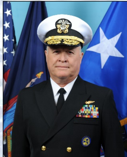
Rear Admiral (LH) Ten Eyck B. Powell, III NYNM