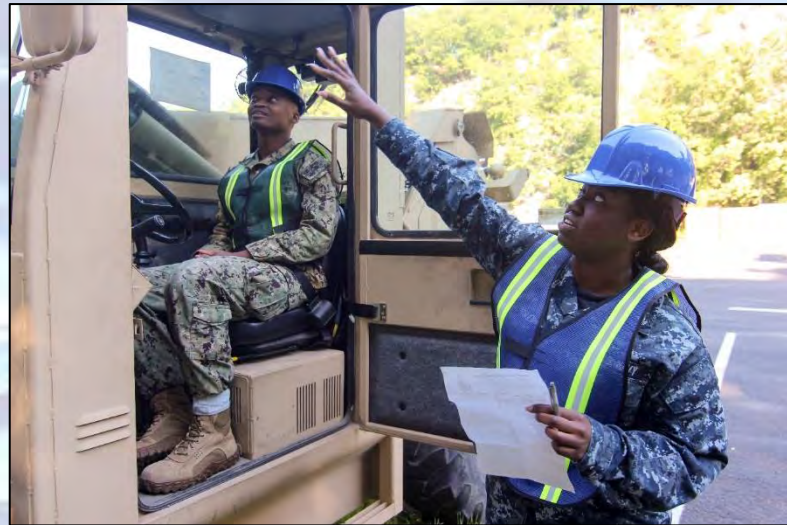
Rapid Gunwale '16 Expeditionary Logistics Support Team Forklift Training