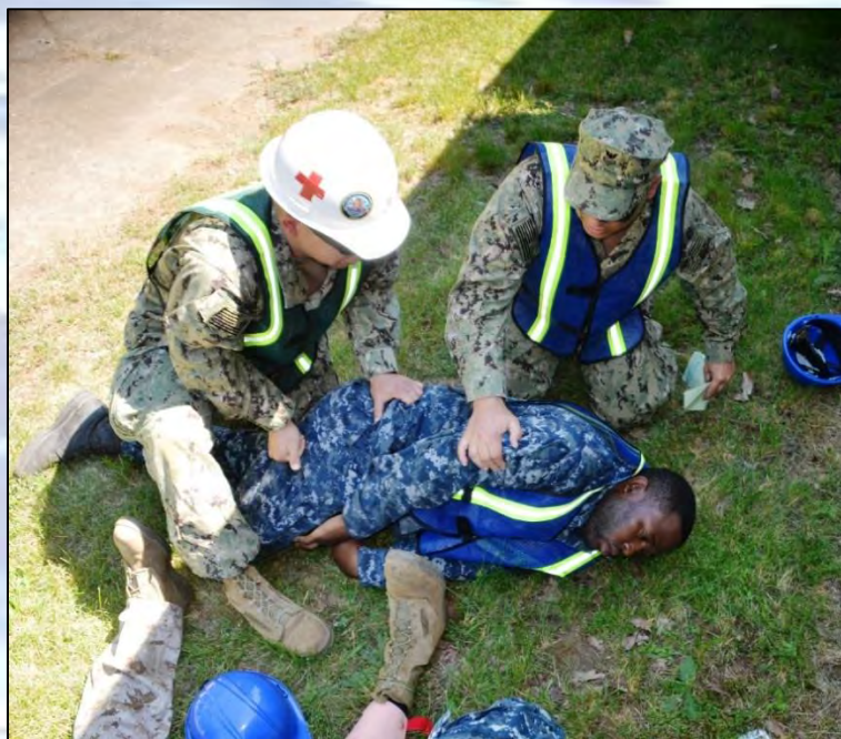
Medical Response Group Training