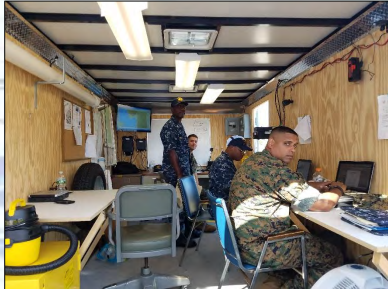
MEBS Command Post

necessitating a “first wave” of Naval Militia members.