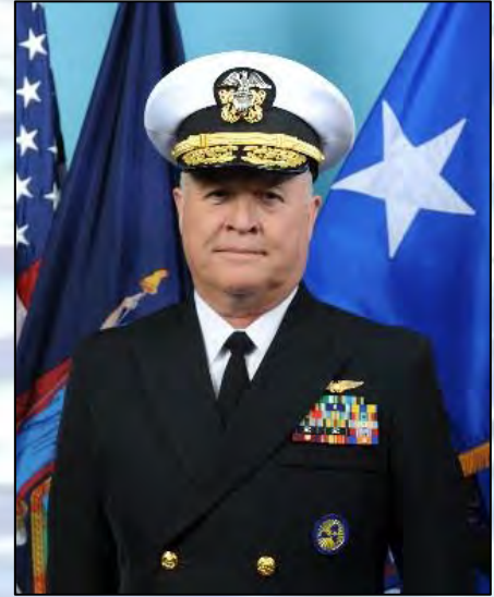
Rear Admiral (LH) Ten Eyck B. Powell, III NYNM