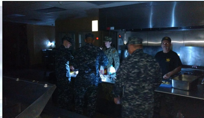
TEAM GALLEY preparing meals in the dark

The NY Naval Militia can be assured to be called on again to help New York communities recover from natural disasters. Now that we have a bench of thirty qualified sawyers, there is an expectation of chainsaw capable rapid response from the Naval Militia. We should expect it and we should plan for it.