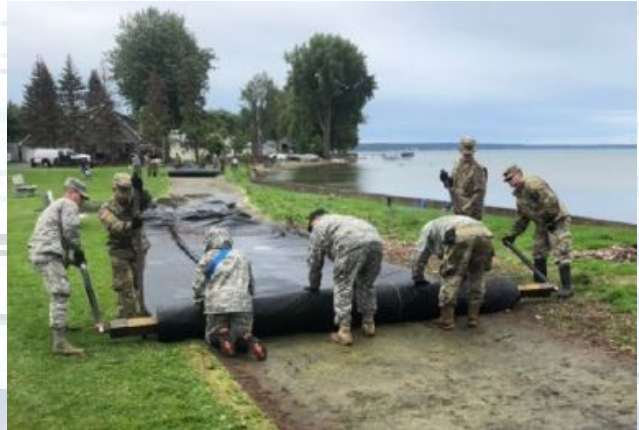
Removal of water bladder at Sackets Harbor

We have an exciting opportunity to spear head training for Joint Reception, Staging, Onward movement and Integration (JRSOI), including Reverse JRSOI for DMNA. This is the process every service member experiences when checking into a mission on State Active Duty to initiate pay, BAH, verify medical readiness and so much more. When this process is done correctly, pay and entitlements are received in a timely fashion. When this process is not smooth the problems are numerous. We will work with all Force Providers to develop an administrative team who will be the first to be mobilized and the last to come off orders. This will ensure continuity from mission to mission and provide additional SAD opportunities for Naval Militia members. If you feel you would be a good fit for the team, please reach out to me. You will be trained at the Latham JFHQ location. A commitment to be available for orders (will not conflict with Federal obligations) and continue quarterly refresher training plus maintaining a working CAC are required.