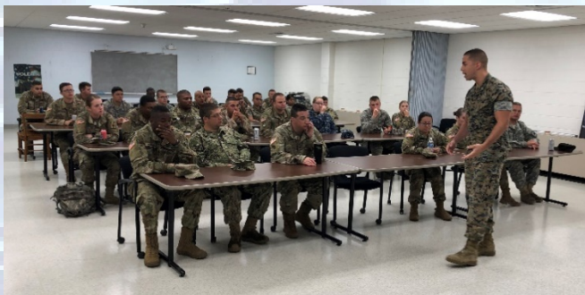
Joint Reception, Staging, Onward movement and Integration (JRSOI) during the Lake Ontario Recovery Mission.

We have an exciting opportunity to spear head training for Joint Reception, Staging, Onward movement and Integration (JRSOI), including Reverse JRSOI for DMNA. This is the process every service member experiences when checking into a mission on State Active Duty to initiate pay, BAH, verify medical readiness and so much more. When this process is done correctly, pay and entitlements are received in a timely fashion. When this process is not smooth the problems are numerous. We will work with all Force Providers to develop an administrative team who will be the first to be mobilized and the last to come off orders. This will ensure continuity from mission to mission and provide additional SAD opportunities for Naval Militia members. If you feel you would be a good fit for the team, please reach out to me. You will be trained at the Latham JFHQ location. A commitment to be available for orders (will not conflict with Federal obligations) and continue quarterly refresher training plus maintaining a working CAC are required.