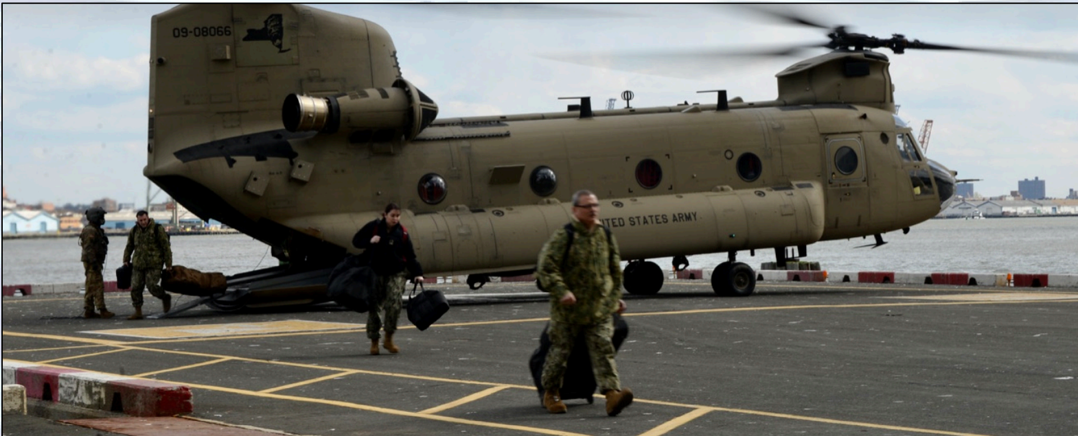
Above: NYNM members arrive for duty by CH-47 Chinook helicopter in NY City 16 April to support the multi-agency response to COVID-19