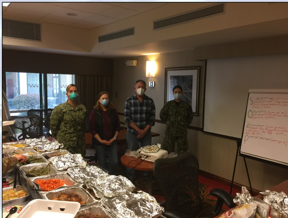
Easter Lunch served for JTF-2, Camp Smith Training Site