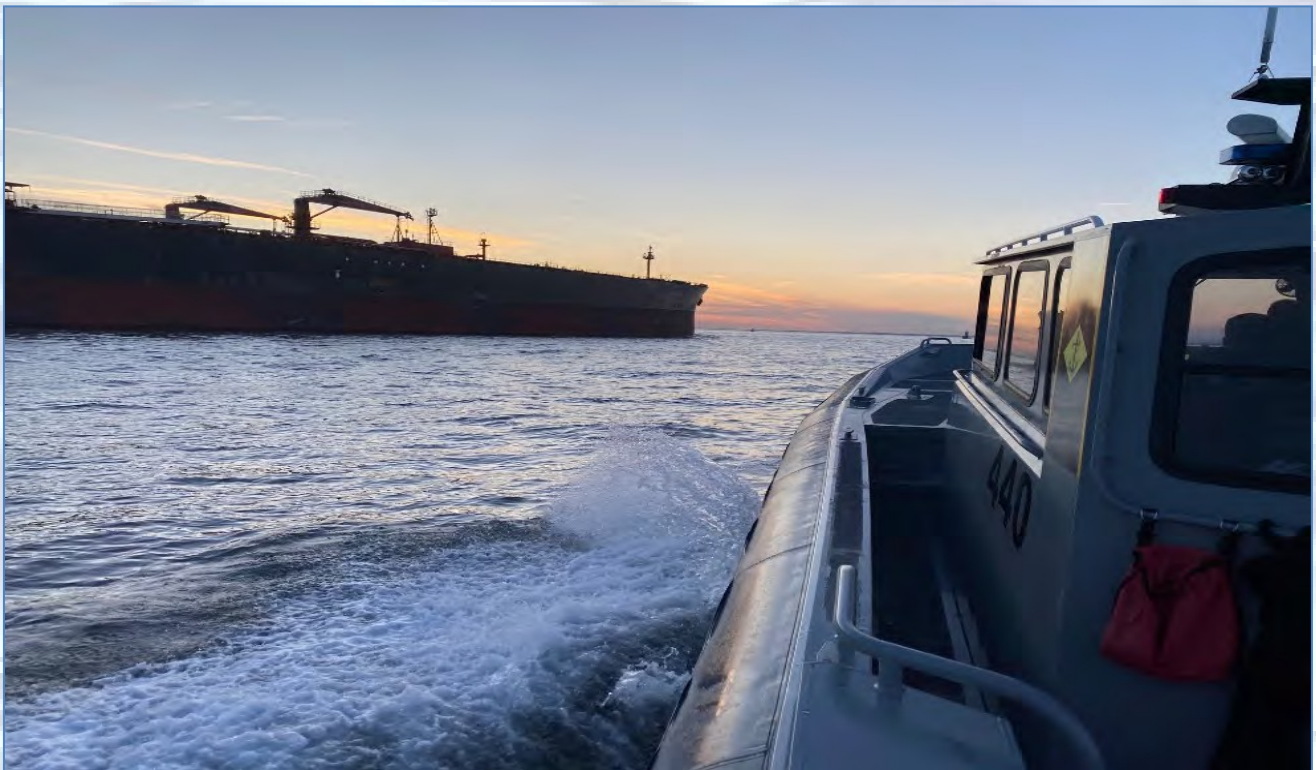
MEBS Det 2, onboard PB 440 approaches a commercial freighter at Ambrose Anchorage during USCG boarding mission Monday, 03 FEB 20